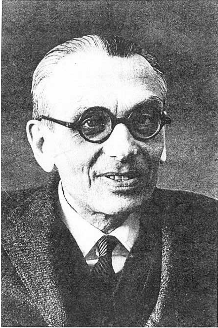
Portrait of Kurt Gödel, ca. 1962.