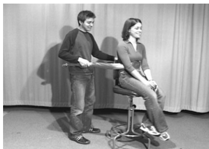
FIGURE 1 | Sample stimuli from Gertner, Fisher, and Eisengart. 20 Children aged 21 months viewed two caused motion events while hearing a novel transitive verb. The children looked reliably longer at the event in which the agent–patient role assignments were appropriate for the word order of the sentence they heard.