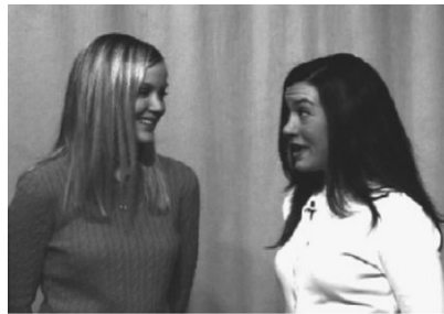
Two-participant test event