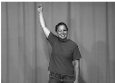
One-participant test event