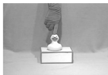
Training: This is acorp (my box)!

Consistent with this prediction, 2-year-olds use sentence structures to learn new prepositions. 28 Two-year-olds watched as a hand placed a duck on a