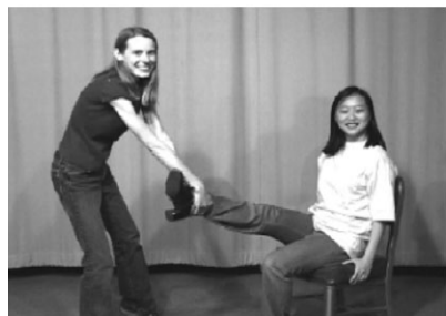
Experimental condition: Where's blicking? Control condition: What's going on?