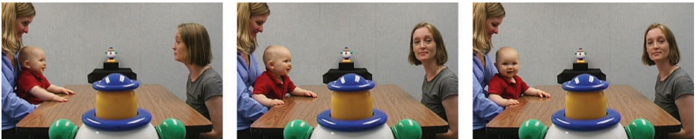
Fig. 2. Gaze following is a mechanism that brings adults and infants into perceptual contact with the same objects and events in the world, facilitating word learning and social communication. After interacting with an adult ( left ), a 12-month-old infant sees an adult look at one of two identical objects ( middle ) and immediately follows her gaze ( right ).

Shared attention. Social learning is facilitated when people share attention. Shared attention to the same object or event provides a common ground for communication and teaching. An early component of shared attention is gaze following (Fig. 2). Infants in the first half year of life look more often in the direction of an adult's head turn when peripheral targets are in the visual field (31). By 9 months of age, infants interacting with a responsive robot follow its head movements, and the timing and contingencies, not just the visual appearance of the robot, appear to be key (32). It is unclear, however, whether young infants are trying to look at what another is seeing or are simply tracking head movements. By 12 months, sensitivity to the direction and state of the eyes exists, not just sensitivity to the direction of head turning. If a person with eyes open turns to one of